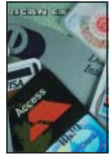
Apply Ace's three-day detection fluid to most non-absorbent surfaces, such as tools or credit cards.