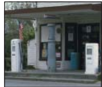
Ace's visible stain detecto paste works great outdoors. Use it on non-porous surfaces, such as locks, parking meters, gas pumps and doorknobs.