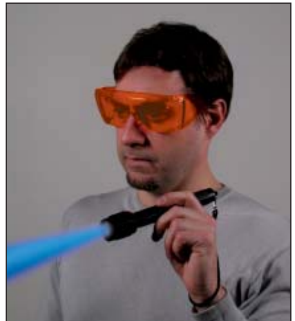
The new compact Mini Bluemaxx™ alternate light source.